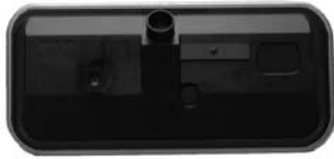
Under Side Cover 94010A

1993-Up General Motors Cadillac : Allante Seville STS Eldorado