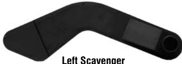
Left Scavenger 94013A