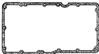
17 Bolt Holes RE4F02A/RL4F02A Upper Cover Gasket