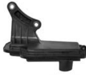
91800 Mazda 02-Up