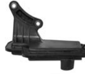
91800 Jaguar 99-Up