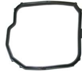
Gasket Valve Body Cover 13971DR