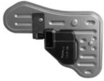
FILTER DPO (AL4) 71800D