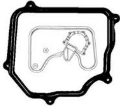
5 Bolt Pan - Rubber Seal AR4