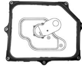
7 Bolt Pan 93-Up AD8

AR4 Eagle Premier w/4 Cyl. 88-89 Also used on various Renault vehicles in Europe.